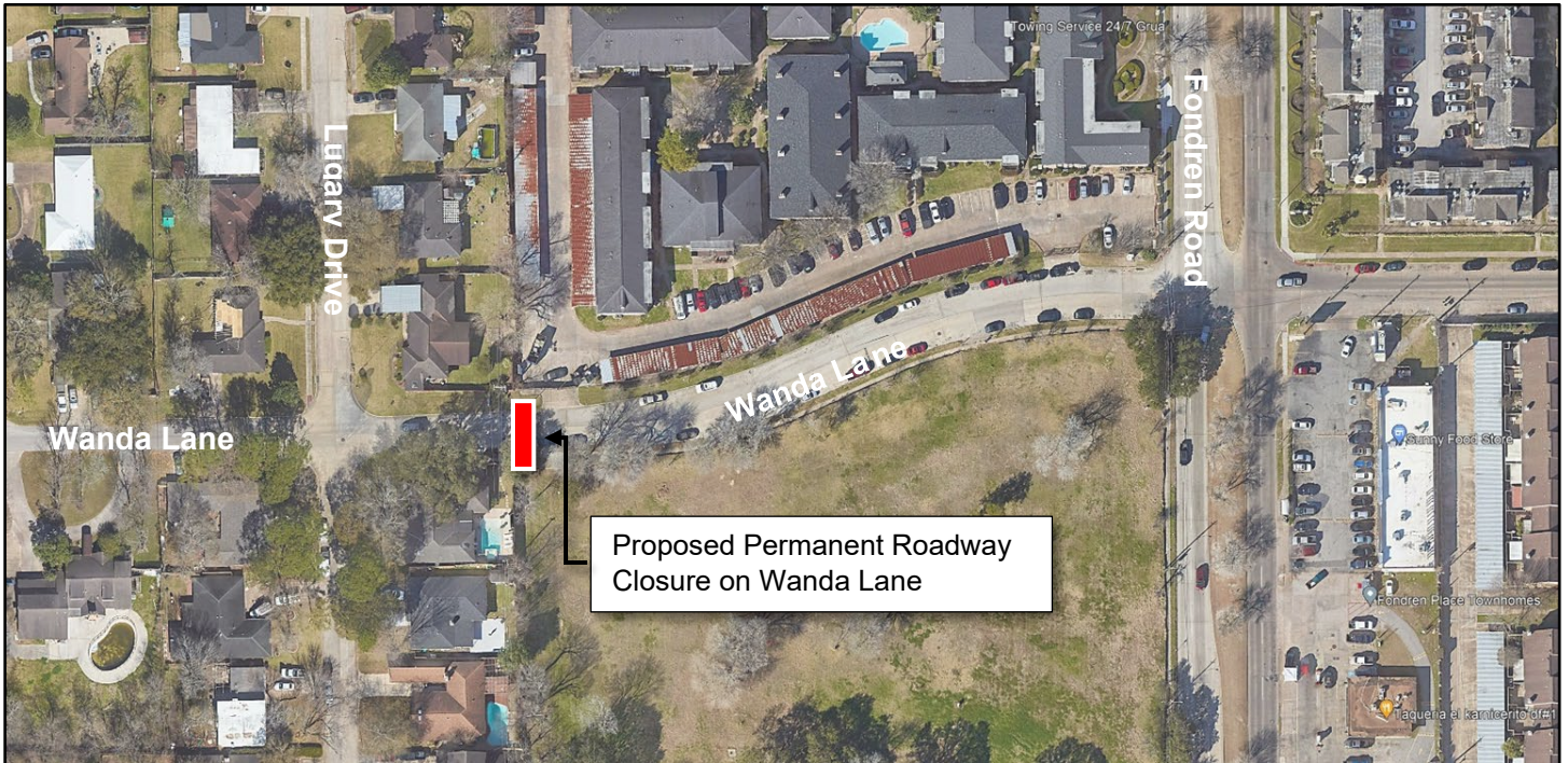
Figure 1: Proposed Location of Permanent Roadway Closure

The Public Notice included information to access the online Public Hearing along with a comment card to allow residents to express their level of support for the proposed permanent roadway closure of Wanda Lane. The comment period extended through June 25, 2024. This memorandum presents a summary of all comments received via the Public Notice.